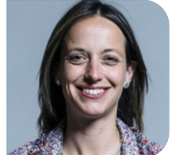
Some of the incumbents we faced in 2019.

Find out more about Stan the Cat at Kent Online and The Daily Mirror .